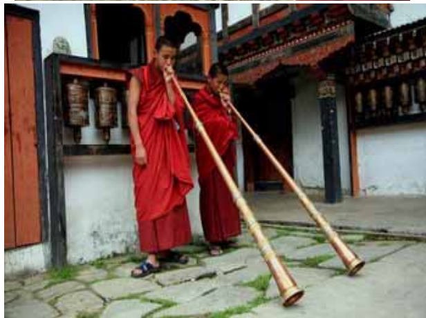
The Bhutanese monk / Yongo traveler with local people

Day 13 Punakha-Paro (125km, 4hrs+ drive): Morning excursion to Chimi Lhakhang. About 400 years old, maintained by a monk with 42 trainees, and linked to Lama Drukpa Kinley, The Divine Madman. Afternoon visit to Ta Dzong (National Museum) and Rinpung Dzong. ON Paro.