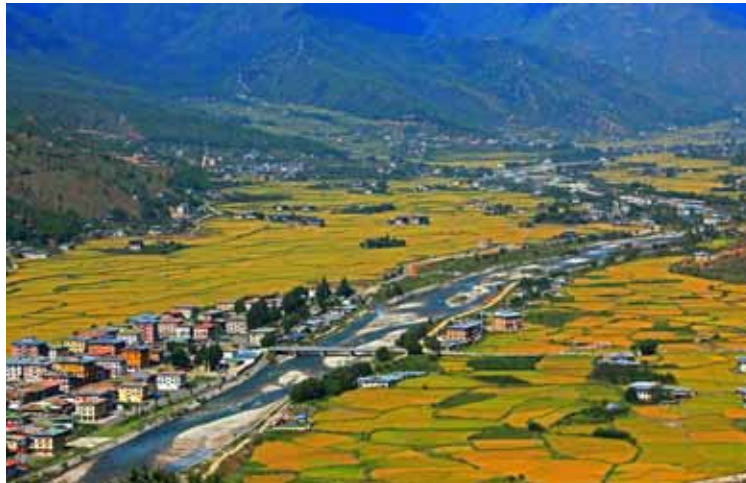
landscape View in Bhutan

This is meant to be a "free and easy" adventure trip. Participants should be relatively fit, with a good sense of humour, and above all, have the right attitude for close travel with others through possibly some trying times. Most definitely, this is not a trip for prudes, whiners, fuss-pots, and other similarly assorted types! We had a couple of those before and it wasn't pleasant for us or them. Although every effort will be made to stick to the given itinerary, ground conditions may change and cause some disruption and/or deviation from the norm. Otherwise, have fun!