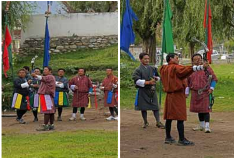
National Archery in Bhutan

Day 16 Home: Take AK62 at 0040AM and reach KL 0655AM early morning on SAT 29 April 2017