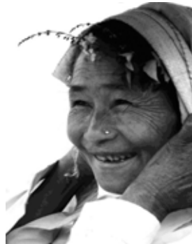
View of Kangchenjunga from Goechala/Darjeeling "tea" town/ Tea lady

Day 3 Tsomgo Lake Excursion (4-5 hrs drive) :After breakfast, drive to Tsomgo Lake, also means as The Source of the Lake (3,780m). Warm clothes needed for this place. The lake derives its water from melting snows off the surrounding mountains, which is one of the famous sacred lakes in Sikkim, situated near the borders of Tibet. On arrival Tsomgo lake start our short trek for 3 Hrs to Tsamgo range which is 4230 Mtrs Back to Tsamgo lake heaving lunch after lunch drive back to Gangtok visit Sikkim Flower Exhibition Centre where a wide range of rare species of orchids display (Seasonal). Evening walk around the local market, 2nd night Gangtok.