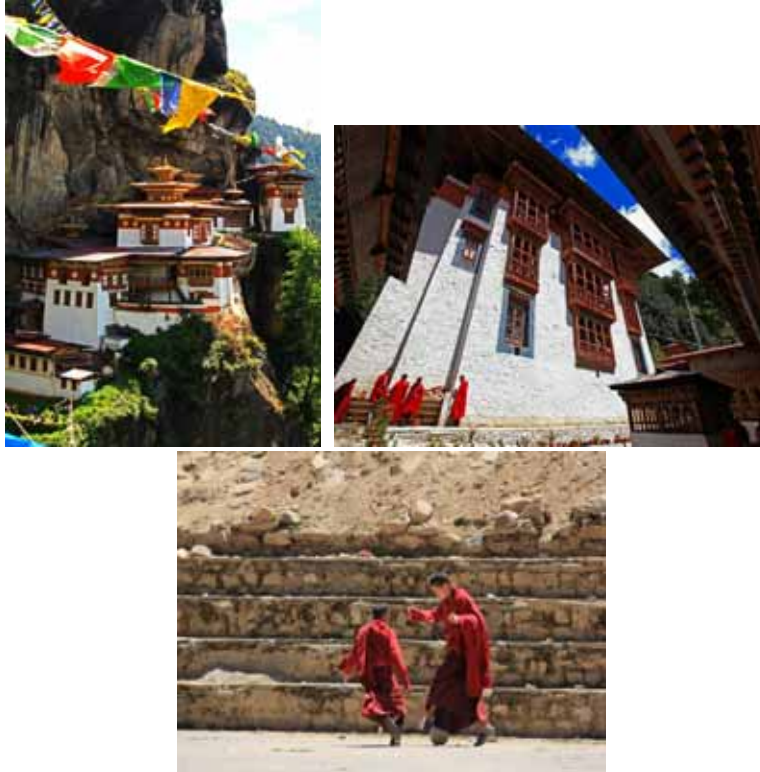
Tiger Nest/Monks/ Little Monk Football match

small temple represents the heaven of Guru Rinpoche. On ground floor there are statues of eight manifestations of Guru Rinpoche and paintings on Buddha's life while the next floor contains eight Bodhisattavas and statues of Avalokiteshvara and Shabdrung Ngawang Namgyal. On top floor, there is a main statue of Amitabha. Evening explore local market. O/N Phuentsholing.