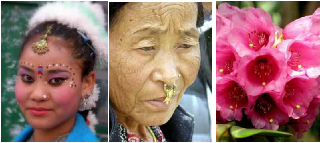
Sikkimese people/ Rhododendrons

Day 6 Gangtok Rumtek Rawangla Namchi (140km, 3-4 hrs drive): Drive to Visit Rumtek Monastery. Rumtek served as the main seat of the Karma Kagyu Lineage in Sikkim for sometimes. But when Rangjung Rigpe Dorje, 16th Karmapa arrived in Sikkim in 1959 after fleeing Tibet, the monastery was in ruins. Despite being offered other sites, the Karmapa decided to rebuild Rumtek. On Completion drive to Singtam for Lunch. Drive to Rawangla to visit Tathagata Tsai also known as Buddha Park. It was constructed between 2006 and 2013 and features a 130 foot high statue of Buddha as its centerpiece. The site was chosen within the larger religious complex of the Rabong Gompa (Monastery), itself a centuries-old place of pilgrimage. Drive to Namchi and transfer to Hotel. Namchi commands panoramic view of the snow-capped mountains and vast stretches of valley. It is also headquarters of South Sikkim district.